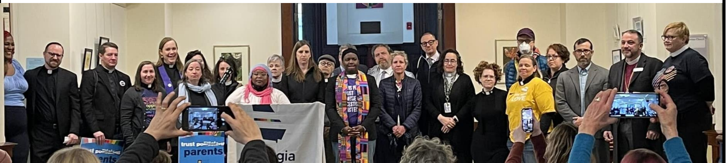
Georgia Equality Prayer Vigil, March 20, 2023; Central Presbyterian Church, Atlanta