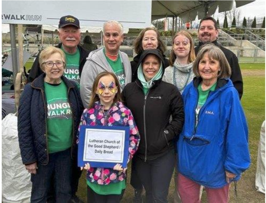
Our Fabulous 2023 Hunger/Walk Run Team