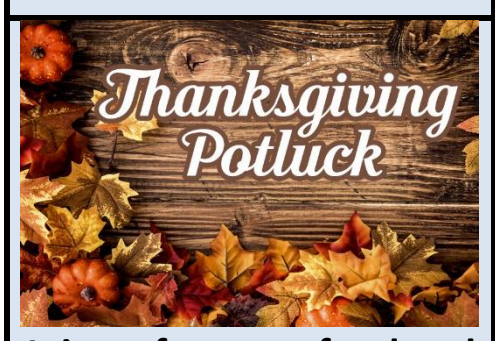
Join us for great food and fellowship at our Thanksgiving Potluck Dinner on Wednesday November 16<sup>th</sup>. Sign-up sheet on the Fellowship Hall door.