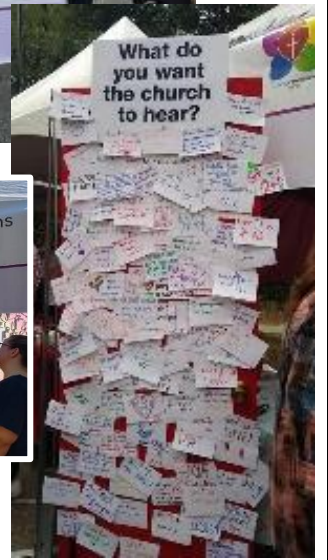
Atlanta Pride 2019