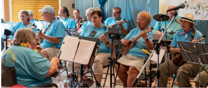
The West Georgia Ukulele Ensemble

Our Play Music on the Porch Day event was a big success! The West Georgia Ukulele Ensemble entertained a full house with great toe tapping music. A wonderful lunch was enjoyed by all, which was provided through a Thrivent Action Team card and donations from volunteers. Representatives from our Boy Scout Troop 3 came to help with the lunch prep and clean up. Over $1500 was raised for those affected by the Hawaiian Wildfires and donations are still coming in. All donations will be sent to the Lutheran Disaster Response fund for the Hawaiian Wildfires after being matched at $0.50 on the dollar by Thrivent.